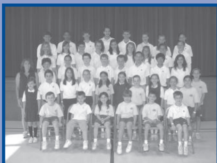
Presidential Award Winners

Physical fitness has always been an important part of the overall development of Mother Seton School (MSS) students. This year, 42 MSS students were awarded the Presidential Physical Fitness Award and 117 students received the National Physical Fitness Award at the end of the annual Field Day.